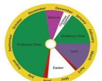
THE LITURGICAL CALENDAR

The season begins on the Monday following the Sunday after January 6 and continues until the day before Ash Wednesday; it begins again on the Monday after Pentecost Sunday and ends on the Saturday before the First Sunday of Advent